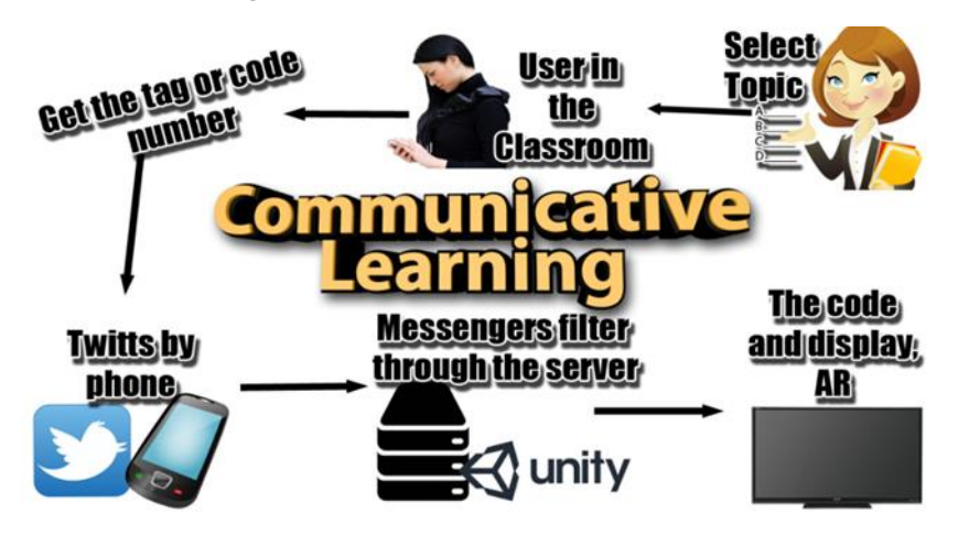
Figure 2. Diagram of a Proposed Communicative Learning

Otherwise a communicative learning process may be shown at the beginning of the session 1, using the Figure 2 for representing an introductory preview to the students to try to establish the group HCI.